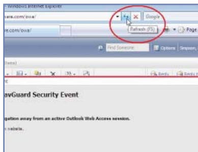
NavGuard warning when the user presses the Refresh button